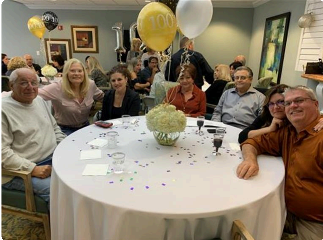
Nov. 1919 100th bday party For carols Dad